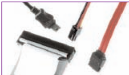
(1) USB, (11) SATA, (11) UDMA/IDE and power cables are included with each unit.

► Integrated USB Connectivity The Omniclone Xi comes standard with an integrated USB port. This port allows the user to connect the chassis directly to any PC that runs Windows. The user will then have the ability to modify, defragment, reformat and manage the master drive contents. In addition, 3rd party software applications can be implemented.