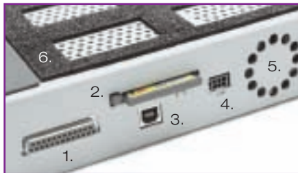
(1) Printer Port, (2) CompactFlash™, (3) USB, (4) Light stack, (5) forced air exit, (6) forced air entrance