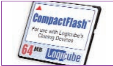
Built-In CompactFlash™ port